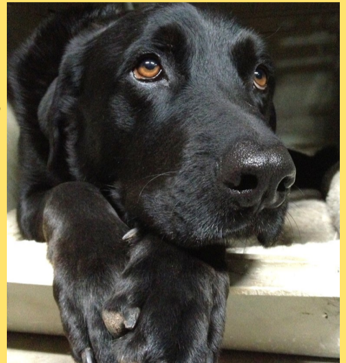
"SWEET SOUL" BY OAKLEYORIGINALS IS LICENSED UNDER CC BY 2.0

Snout licking, paw lifting lowered posture, body shaking, increased salivation, panting and the development of stereotypies are also indicators of stress. 6,7,8