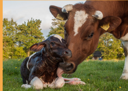
"New born Friesian red and white calf being licked by mama cow" by Uberprutser

What's the big deal? → Cross-sucking is associated with diseases such as mastitis (udder inflammation), and the development of ear and navel abscesses 5 (collection of pus) Thus, this calls for prevention methods!