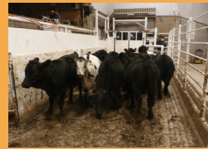
"Scoring on this group of cattle"

Frequently regroup cattle so the bond between the sucker calf and the sucked calf is broken! 7