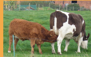
"Teat Time" by Wildlife Terry

Provide calves with artificial teats in their pens to suck on, instead of their neighbors 2