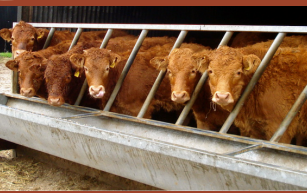
"Cows lined up"