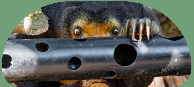
Bear trying to get kiwi form pipe. Marked for creative commons use