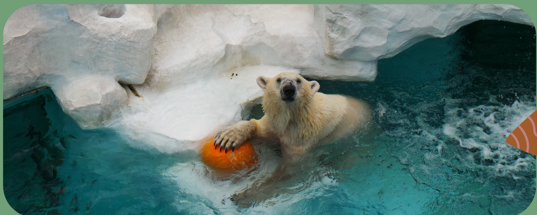
Bear with enrichment toy.